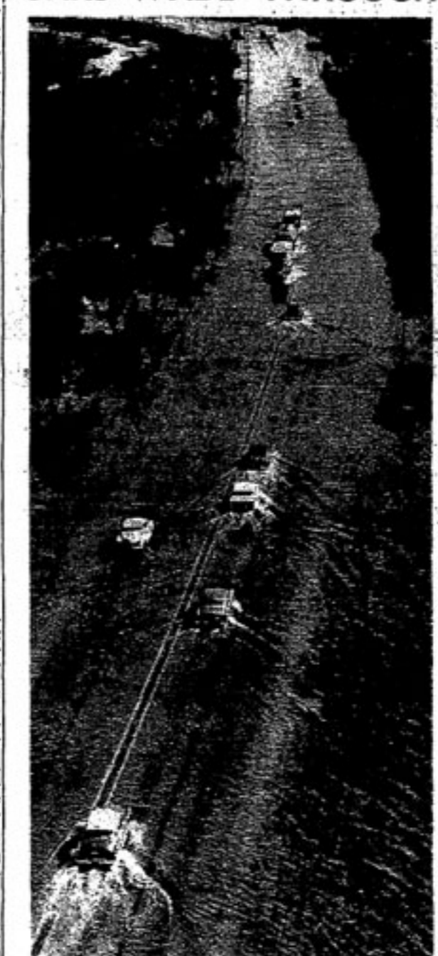
WATER STILL COVERED the Chef Menteur hwy. near the intersection of Hwy. 11 today, but traffic was resumed to and from the Mississippi Gulf coast. Cars and trucks barged through at a snail's pace.

By ALEX VUILLEMOT (New Orleans States Staff Writer) POINTE A LA HACHE